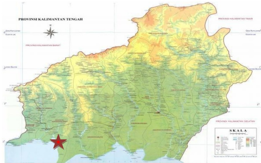
Fig. 1. Research Location Map

\alpha_2 \beta_3 = direct influence of the environmental uniqueness to length of stay through tourist visits